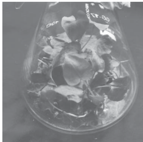
Fig. 2. The P. ternata in vitro plantlets with green leaves and white roots in the jar