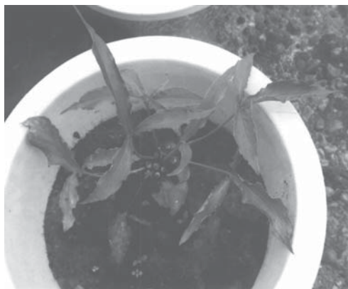
Fig. 3. The mature plants from in vitro plantletsq showing the compound leaves and brown bulbils (rotundity shape ones)

years old plants in natural propagation (Peng and Cheng, 2006). The bulbils in the in vitro plants were smaller than those from nature propagation, as the in vitro plants were still small at that time. But they could develop into normal plants too. All of the in vitro plants developed bulbils, with one in vitro plant growing 12.8 bulbils in mean. Considering that one plant from nature propagation grow only 7.8 bulbils in mean as reported by Pan (1998), the in vitro plants could be considered having higher propagation rate than the nature ones.